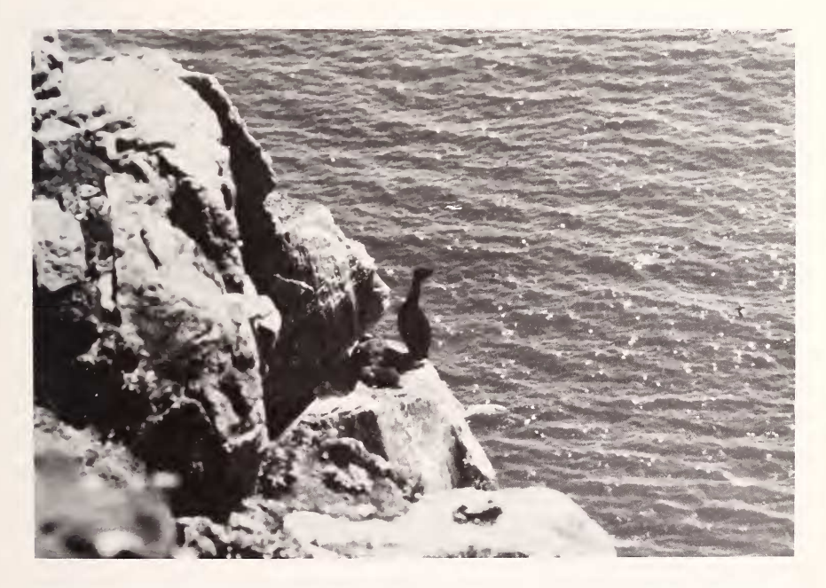
Fig. 12. Typical nest site used by pelagic cormorants on coastal cliffs and islands; Shaiak Island, 17 July 1976.

Cormorants were found along the coast and in estuaries. They migrated past Cape Peirce in spring (peak migration rate of 260 birds per hour on 2 May 1973) and may migrate along the coast in late fall. J. G. King (unpublished) saw more than 10,000 pelagic cormorants near Hagemeister Island on 30 April 1974. Generally, migration along the coast occurred from 28 April to 1 June; however, D. I. Eisenhauer (personal communication) found birds in Chagvan Bay on 18 April 1973. Birds nested on all suitable coastal cliffs (Fig. 12) from the Beluga Peaks in Goodnews Bay to the Walrus Islands. The following are breeding population estimates (from Sowls et al. [1978] except as noted): Big Beluga, 420 pairs (DNW photo); Little Beluga, 30 pairs (DNW photo); Cape Peirce, 350 pairs (nest, eggs, MHD photo; nest, young, MRP photo); Shaiak Island, 50 pairs (MHD photo; MRP photo); Hagemeister Island, 345 pairs; Walrus Islands, 9,780